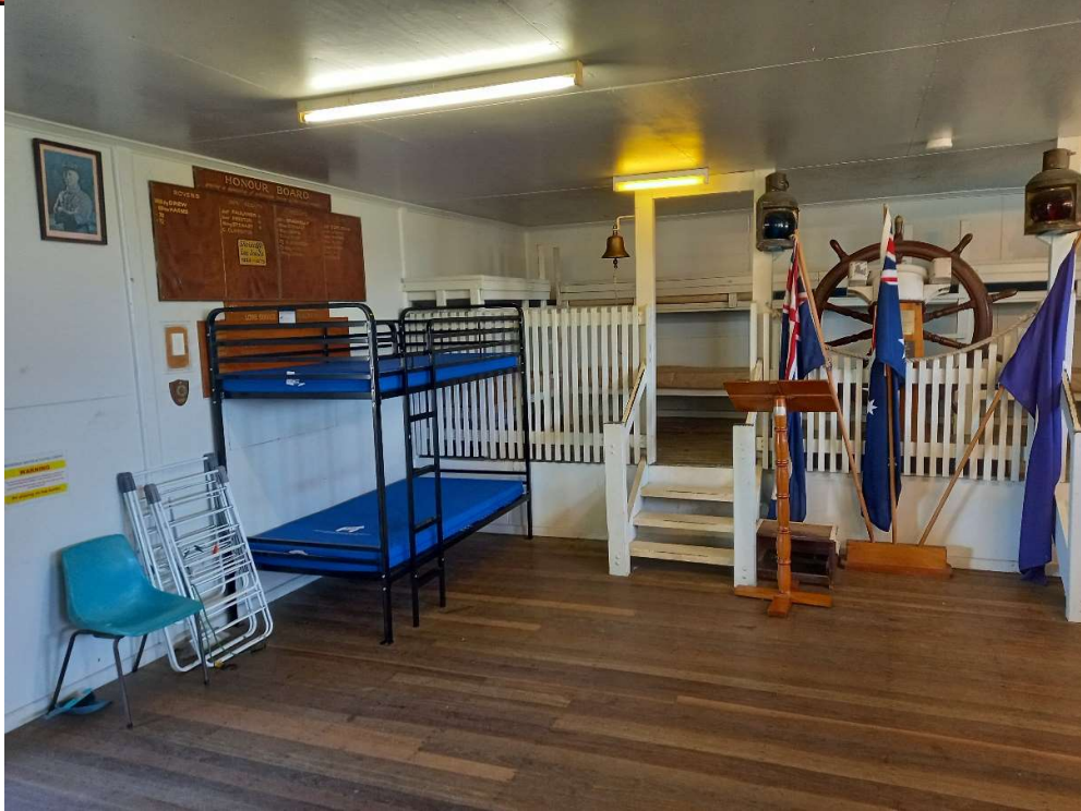
Adult Rated Bunk Beds in the Curlwys Dorm