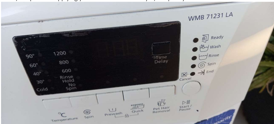
Figure 1 Facilities include a washing machine

A washing machine is available for use by anyone in the facility at no charge. Sometimes there is donated Powder there, but plan on supplying your own. There is no dryer, but plenty of ocean breeze.