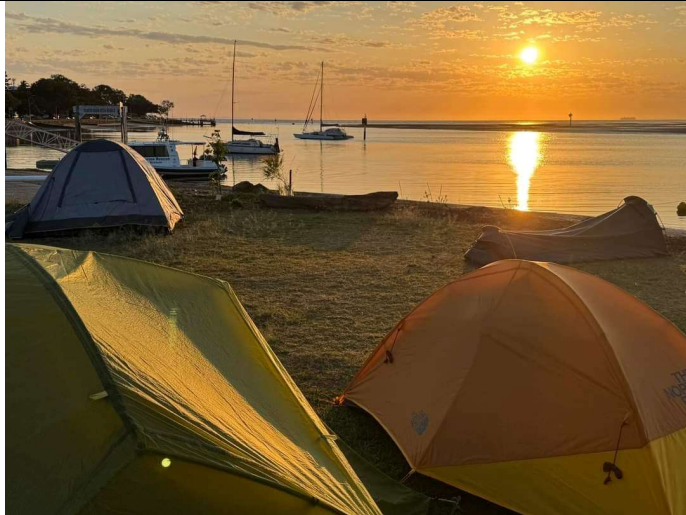
Foreshore Camping Location